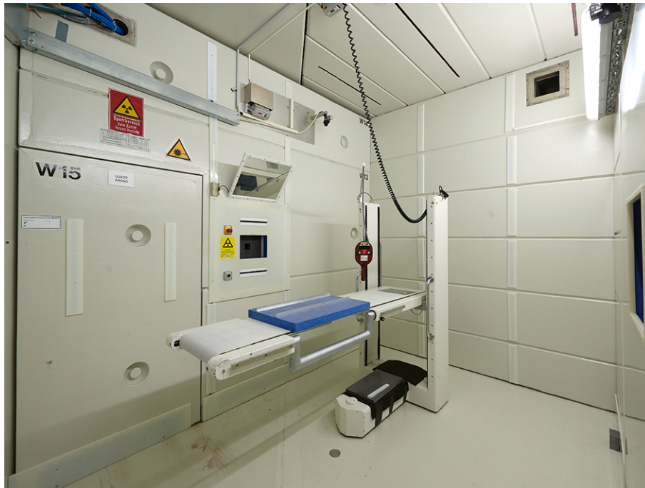
Figure 1: The irradiation room of MEDAPP.